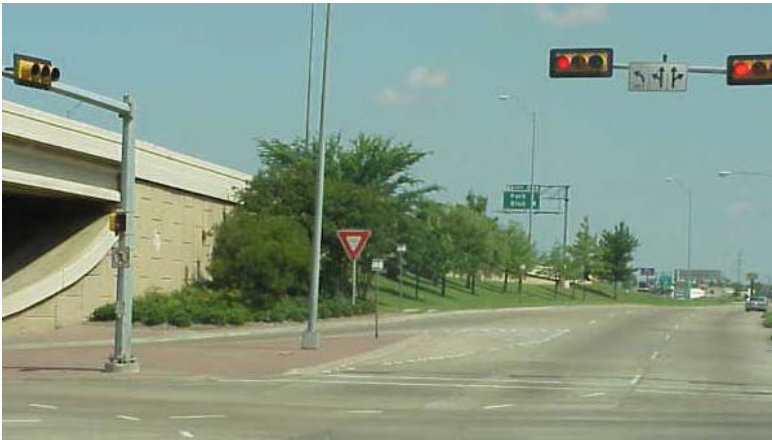
Natural plantings and aesthetic roadway designs

The landscape portion of this effort has resulted in a broadly similar practice on TxDOT construction efforts. “Naturalized plantings” that replicate native plant communities are installed within the right-of-way at the conclusion of construction activity. Local agencies or groups are responsible for maintaining any of the ornamental or special landscaping elements.